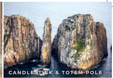
CANDLESTICK & TOTEM POLE