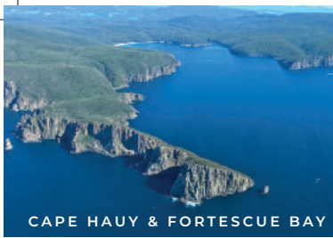
CAPE HAUY & FORTESCUE BAY